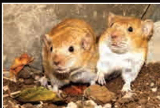
Transcaucasian Mole-vole, Summer 2010

Considerable evidences of the presence of brown bear, including footmarks, droppings, and broken branches of fruit trees, were found. This testifies to the wide dispersion of this animal in the area. The frequency of reports on bear presence and activity has partially to do with bear-human conflicts over such things as fruit gardens for which bears are notorious. In the last trip made by our researchers to Dena region, a mother brown bear and a cub were captured on camera trap in Laysorkh Valley at the foothills of Pazanpir Mountain. Also, 10 incredible pictures of brown bears were