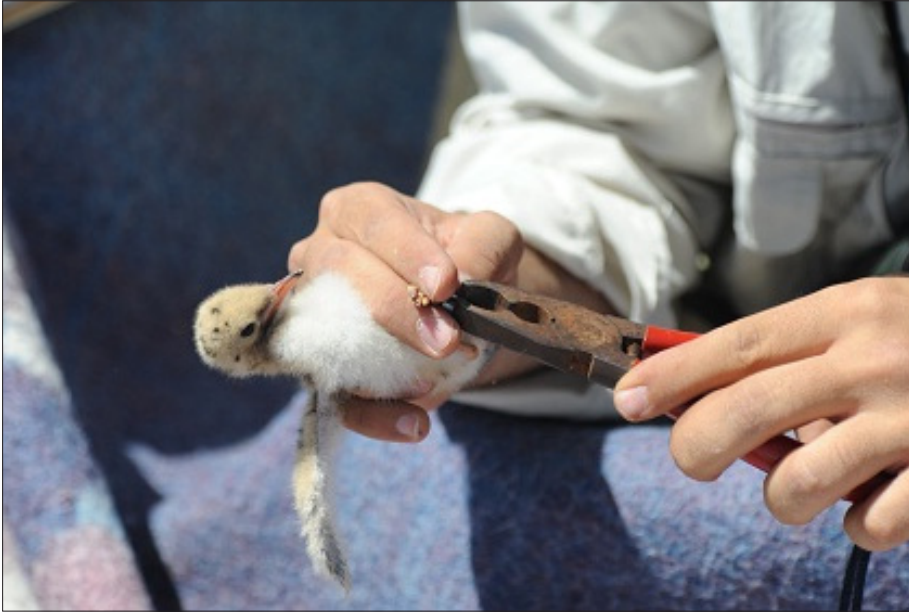
Brood of Armenian Gull