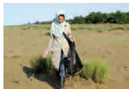
Miankaleh northern shore after cleanup