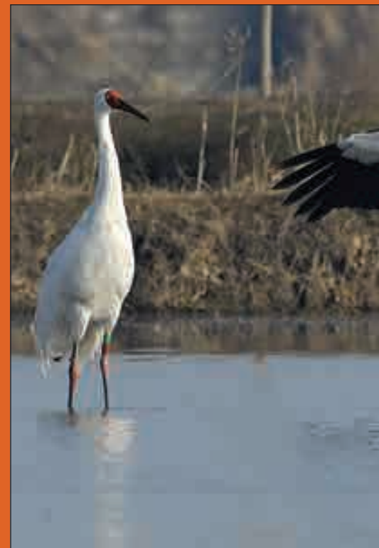
Siberian crane, Winter 2008, photo by: Houman jowkar

The eastern group wintering in China is relatively stable with approximately 3000 birds remaining. The western population spends its winters in Iran, but of these birds only one has returned after two years of absence and has been nicknamed Omid - Hope - by the media.