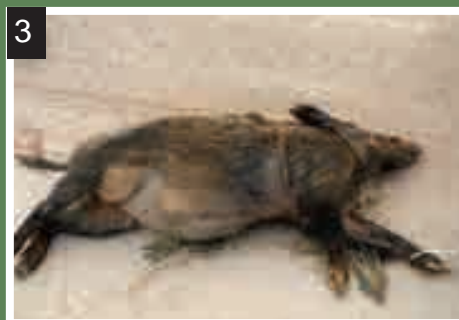
1) Map showing the overlap of the area of distribution of wild boars and the density of road mortality. 2) Wild boar passing under Hesabdari bridge; 3) Wild boar killed in car accident (Golzar camp)

Frequency of boar sightings in Golestan National Park should not be thought as a basis for down-playing the threats to this species' population. In the last 6 years, based on estimates drawn by experts, the numbers of this species have been steadily decreasing. Due to a growing trend in habitat destruction, rise in vehicle traffic on Asian highway that passes through the Park, increase in issuing permits to carry guns, and poaching, this valuable species, which is considered a keystone species too, has faced a considerable drop in population and it seems that the decreasing trend has even intensified in recent years.